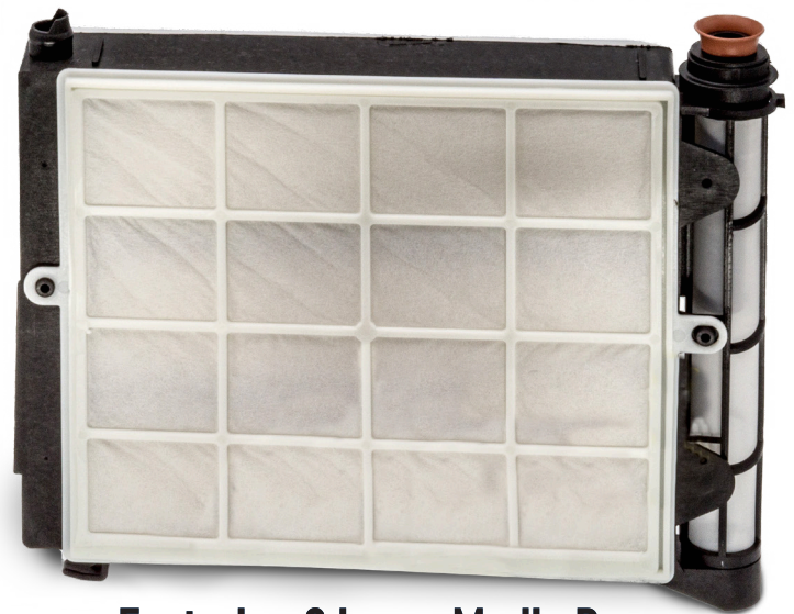
Featuring 3 Layer Media Paper

We've got the right product, the right quality and the right price to meet your needs!