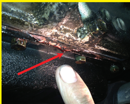
Leak due to gasket not conforming to pan irregularities

Traditional cork-rubber compound transmission pan gaskets can be subject to leaks because they have limited flexibility to conform to pan irregularities and can easily be crushed and crack if the pan is torqued down too much.